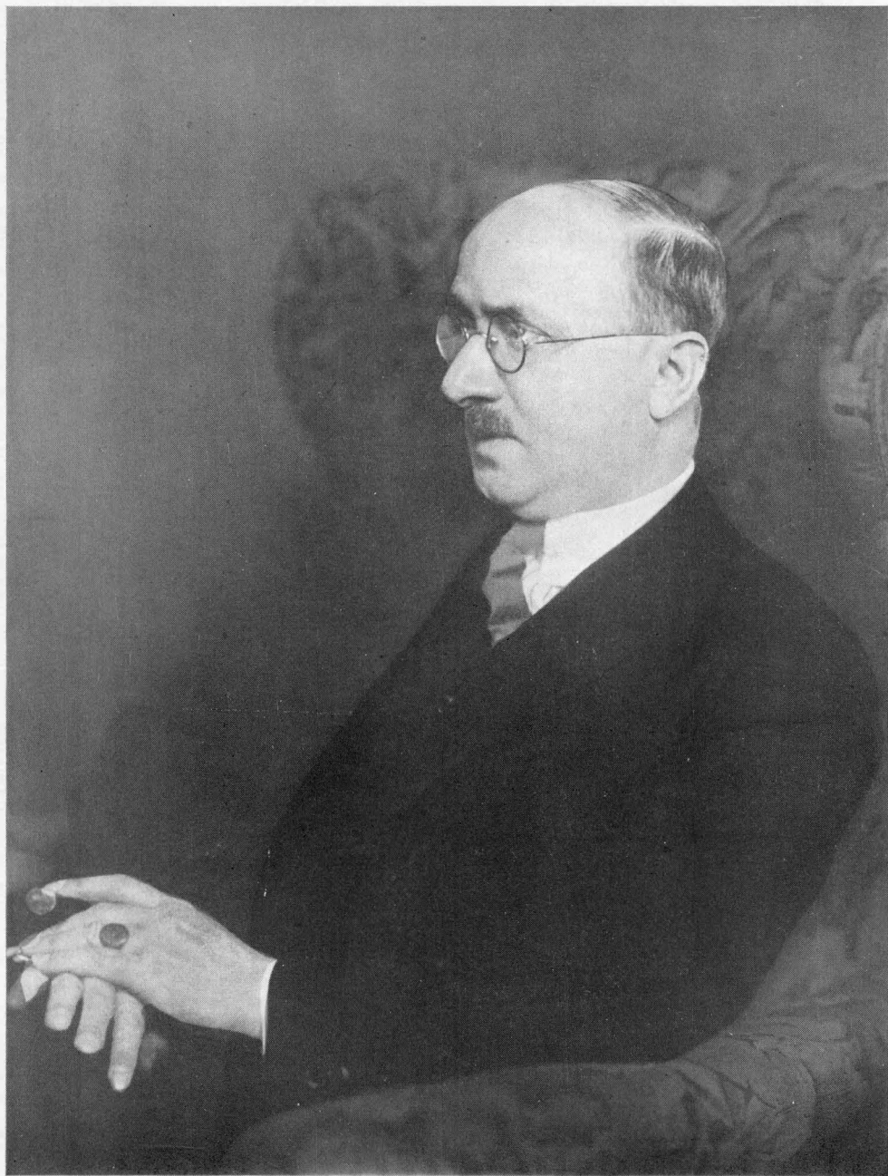
MAX EITINGON, M.D. 1880-1943